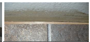
Floating Method Perimeter Expansion Space